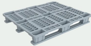
3-Runner Grid — Underside