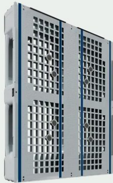
Open Deck — Top View