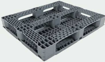
Three Parallel Profiles — Top View